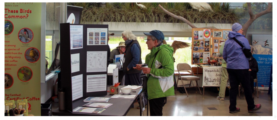
Be sure to visit the website to view the most recent vendor list.