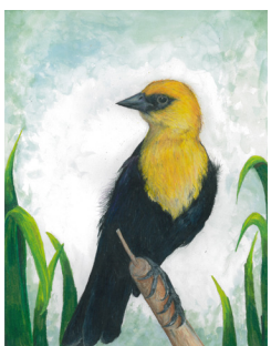
Veronica Gao 1st Place, Grades 4-6