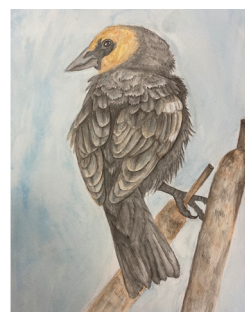
Zoe Bye 1st Place, Grades 7-9