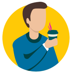
Decrease in sense of smell or taste