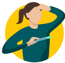
Fever (temperature of 100.4°F or 38°C or higher)

*These symptoms are criteria to get tested for COVID-19