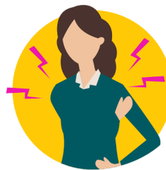
Muscle aches & pains