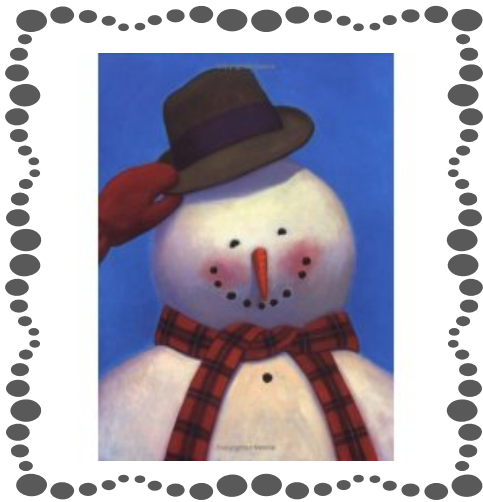
Snowmen at Night!

"Get A Clue About Writing and Illustrating A Children's Picture Book"