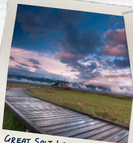
GREAT SALT LAKE SHORELANDS PRESERVE