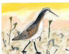
Zoe Oyler 1st Place, Grades K-3