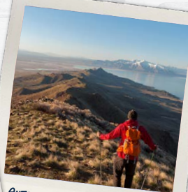
ANTELOPE ISLAND STATE PARK

Book a stay in one of our nationally recognized hotels or dock your RV in one of our many RV parks or campgrounds — either way, Davis has the perfect lodging option for your Bird Festival adventure.