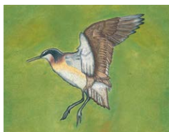
Riker White 3rd Place, Grades 10-12