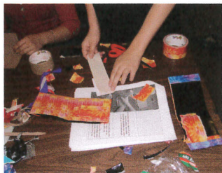
A duct tape program for young adults