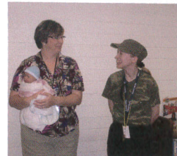
Young Adult program Babysitting Boot Camp June and August

Accommodations for patrons with special needs may be made by contacting the branch librarian.