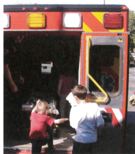
Fire safety storytime