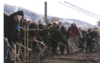
Ground breaking ceremony for the new Davis County Library and Administration Building