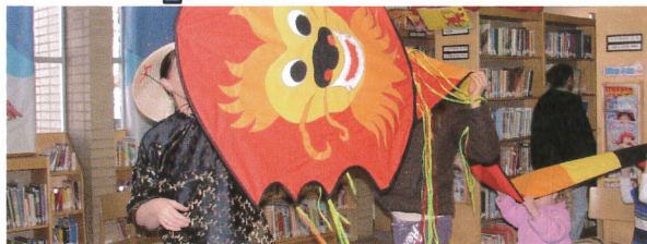
Children at the summer reading program explored our world