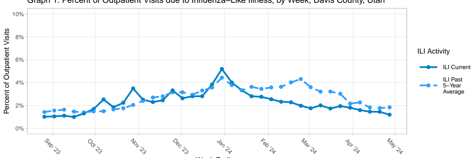
Graph 1. Percent of Outpatient Visits due to Influenza-Like Illness, by Week, Davis County, Utah

Graph 1 displays the weekly percentage of outpatient visits due to influenza-like illness (ILI). For comparison, the dashed line shows the previous 5-year average (2018-2022) of ILI activity. This week's ILI rate was 1.2%.