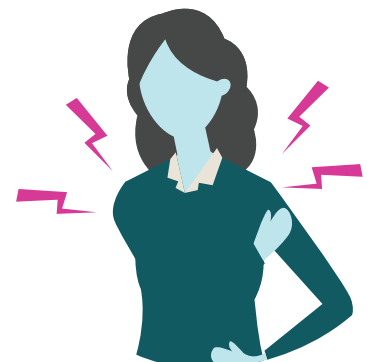
Muscle aches and pains