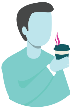
Decreased sense of smell or taste