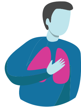
Shortness of Breath